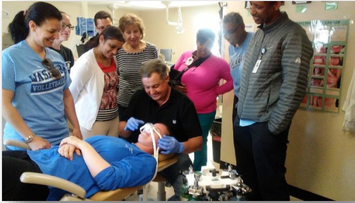
Marian Dental clinicians in the clinic practicing the nitrous oxide technique.

Patients will be 100% conscious, yet able to follow directions and be very relaxed for their dental appointments. Currently our clinic is referring patients to a clinic ~40 minutes away to receive these services. Following implementation of our sedation program, the clinic anticipates seeing patients spanning a 60+ mile radius of Topeka. We will be casting a wider net, serving more people in need!