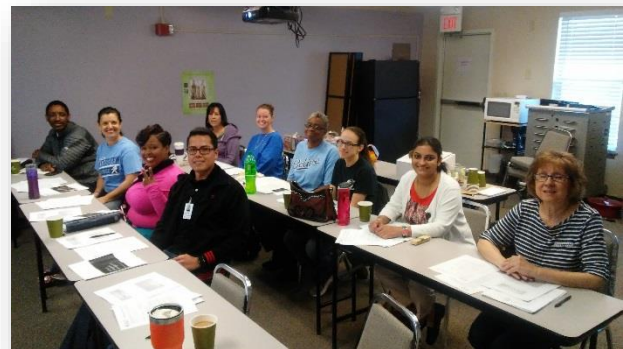
Marian Dental clinicians in the classroom.

Our Dental Team attended Nitrous Training at Manhattan Area Technical College. This training is required by the Kansas Dental Board for all dental assistants and dental hygienists. 3 dentists, 6 dental assistants, and 2 hygienists attended the 16 hour training beginning of May. The clinic hopes to begin offering nitrous oxide to patients with dental anxiety, and small children who need extensive dental surgery by August 1st. Nitrous oxide is one of the safest forms of light sedation and the least invasive. (continued on next page)